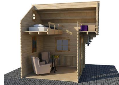
GH LOFT (Metric Sizes Above)