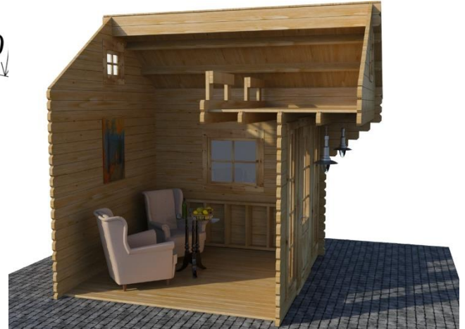
GH LOFT (Metric Sizes Above)